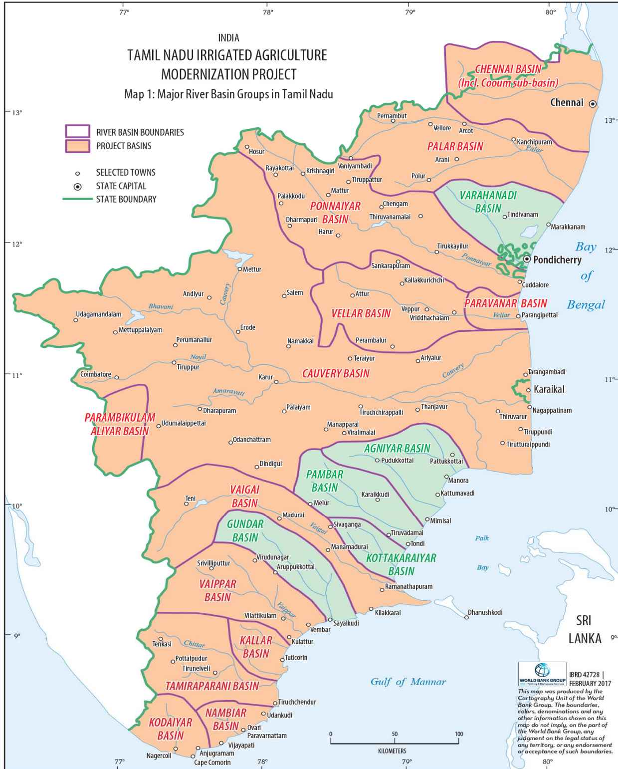
Figure 5.1. Major River Basin Groups in Tamil Nadu